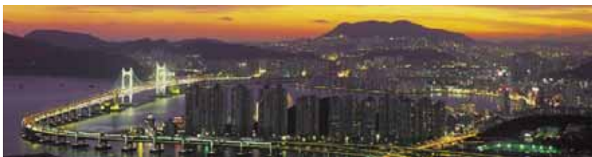
Feel the new bright night