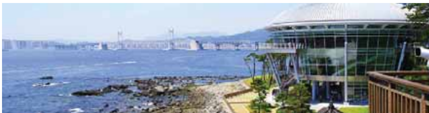
Fascinating congress destination