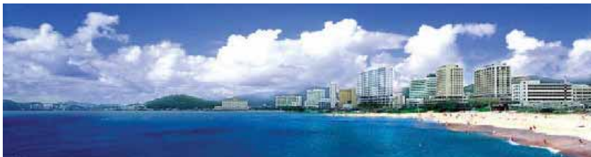
Walking path along the seaside