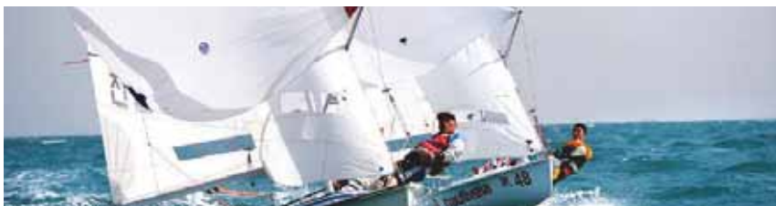
Enjoyable leisure activities